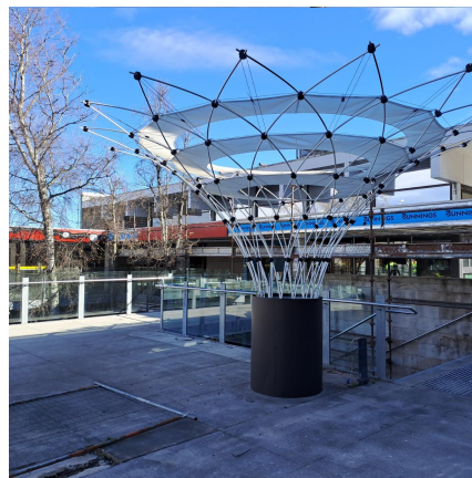
Blue Mountains Council NSW