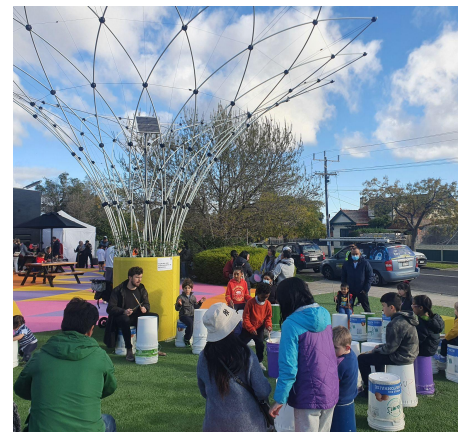
Brimbank City Council VIC