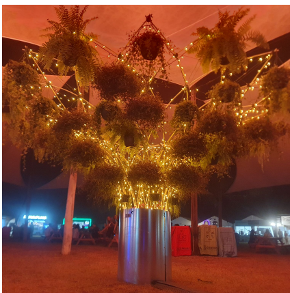
Pitch Festival, VIC